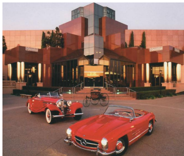
Evening Reception at the Blackhawk Museum

Join this event and uncover emerging concepts to accelerate adoption of new technologies; learn how pending public policy developments might impact industry dynamics.