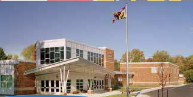
Sargent Shriver Elementary School